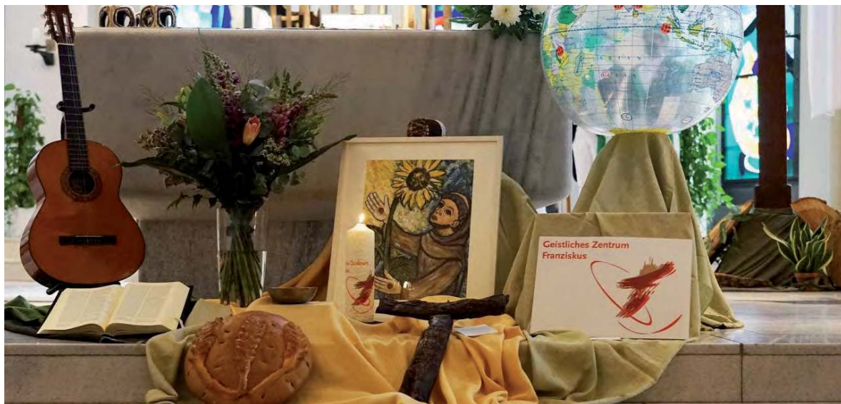
Elements from the special procession of gifts & encounters and presentation of the offers in the Motherhouse Garden